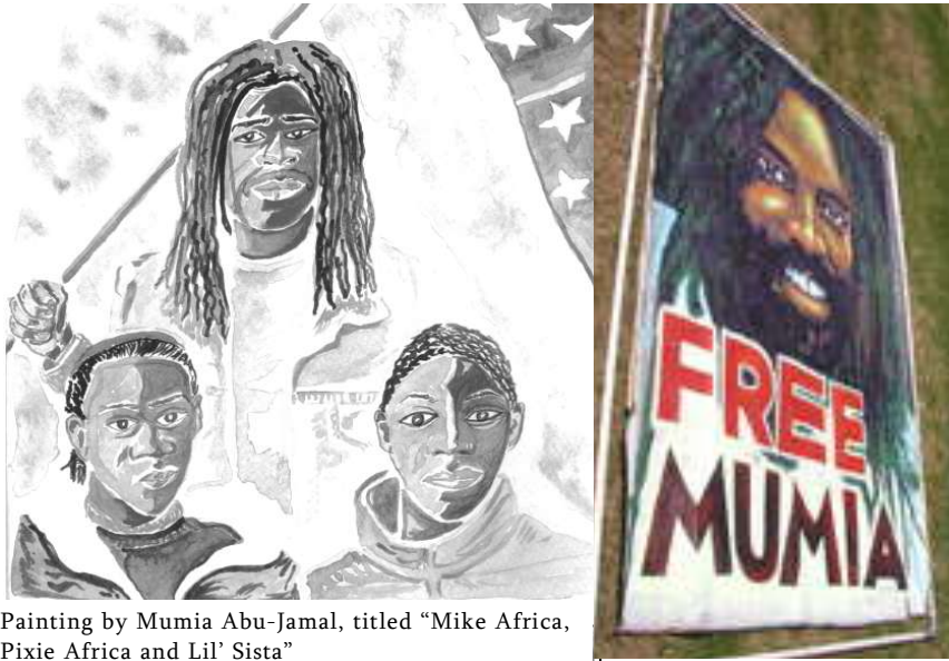
Painting by Mumia Abu-Jamal, titled "Mike Africa, Pixie Africa and Lil' Sista"