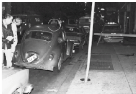
The photos above and below show that Officer Faulkner's hat was moved from the top of the car to the sidewalk for police photos.

With news media brushing off 'hot-button' items like pain, the brush-off of crime scene photos is somewhat understandable.